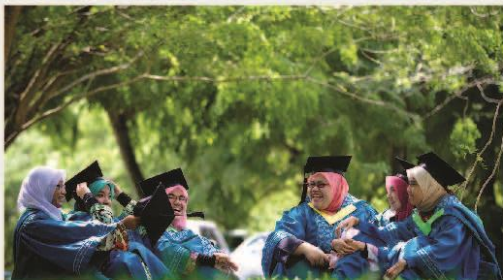
A GROUP OF NEW GRADUATES IN CHAT

one of the great leaders in the contemporary world, especially in the Muslim world. He realized that there is no contradiction of modern education with Islamic Studies. In fact, the meaning of Islamic education is not just studying Qur'an and Sunnah; of course, it is essential for all of us to study Qur'an and Sunnah. But in addition to this, we also need to study Science, Medicine, Law, Accounting, Geography, Mathematics, Psychology, and the list goes on. Islamic education should lead the man becoming a true khalifah of Allah (vicegerent) on the earth. This is the way through which Muslims can restore their past glory in this contemporary world.