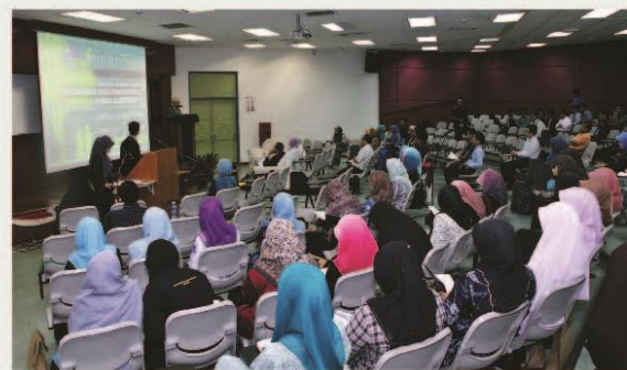
A seminar room

The fourth and final part of the mission statement of IIUM is Comprehensive Excellence. This means that highest level of efficiency is the order of the day