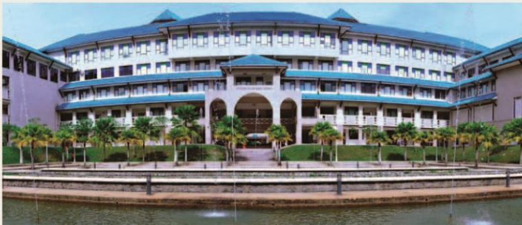
Cultural activity centre IIUM

In the golden era of Islam, for the purpose of higher education, many people used to go to Baghdad, Damascus and many other great cities in the then Muslim world. Here they used to study, in addition to Qur'an and Hadith, Mathematics, Medicine, Science, Philosophy and many other subjects. But now with the passage of time, the situation has completely changed. Today, for higher studies, they do not go to Baghdad, Damascus, Cairo, rather their focus is towards USA, UK, Canada, or Australia.