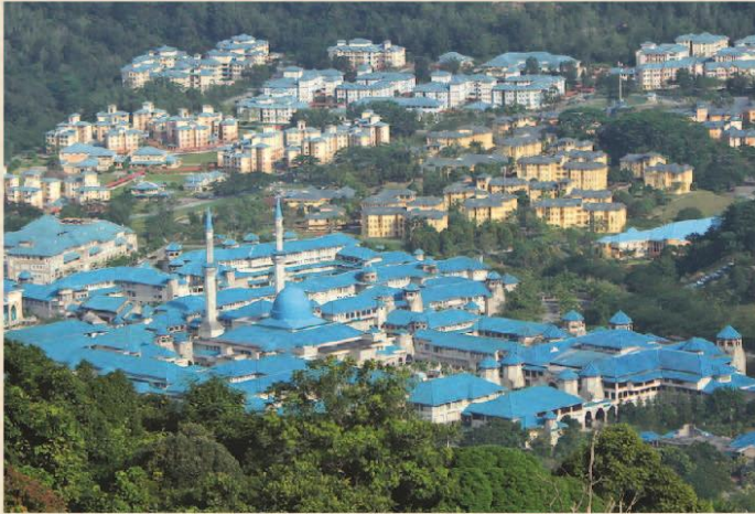
A bird's-eye view of IIUM

for all activities carried out at IIUM – be it academic or administrative.